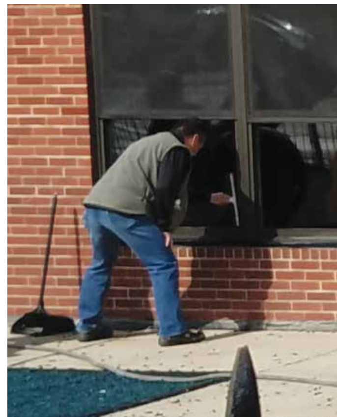
DC #14 worked with Kreative Kids Academy, they collected donations to buy new books to rebuild their Library, also a complete clean up interior and exterior of the nursery at two of their facilities located at 26 E 79th Street, and 8236 Cottage Grove Chicago, IL