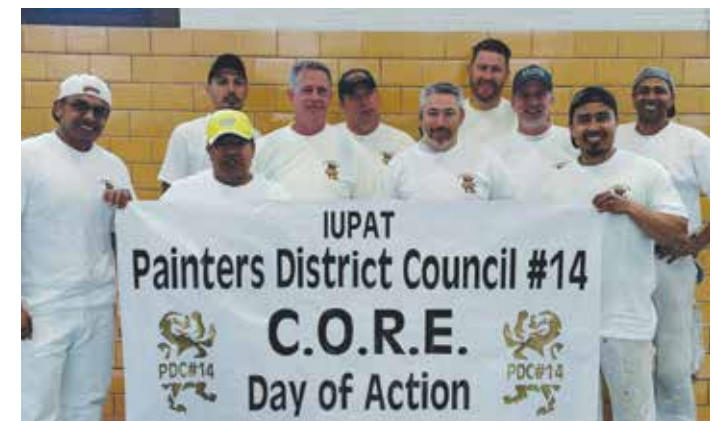
DC #14 repainted Pope Francis Global Academy located at 6040 Ardmore in Chicago IL