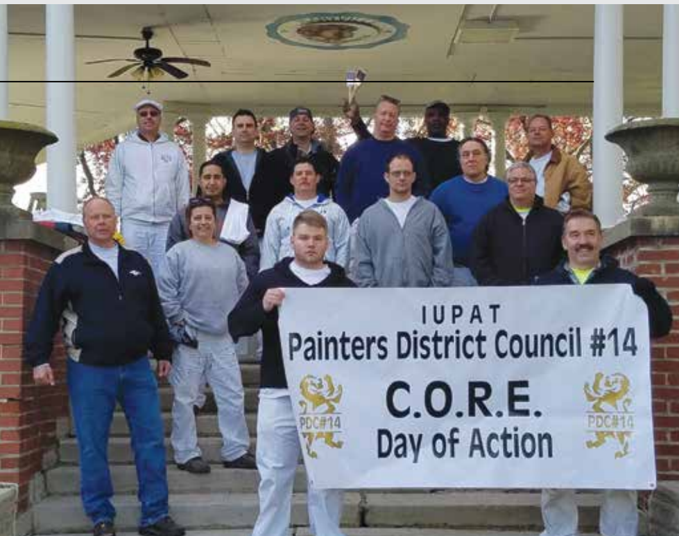
DC #14 members painted front porch and did touchups around the campus at the Maryville Academy/Shrine of Guadalupe located at 1170 N. River Road in Des Plaines IL