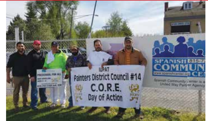
Day of Action - the members helped clean up the Spanish Community Center located in Joliet, IL