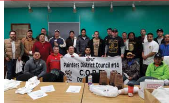
DC #14 members cleaned, re-organized and painted the locker rooms for the Galowich YMCA located in Joliet, IL.