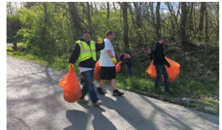
DC #14 members joined the Fairmont Community cleanup project in the Lockport Township area. They helped clean up the roadsides.