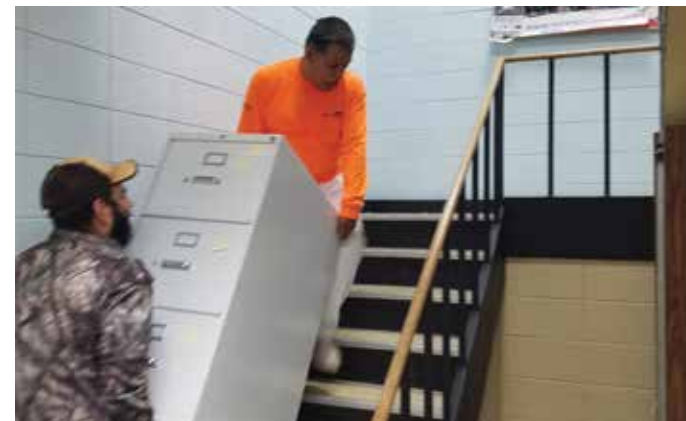
Members helped move furniture at the Spanish Community Center located in Joliet, IL